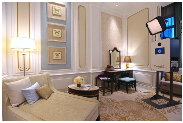
Photobooth Setup in the Bedroom