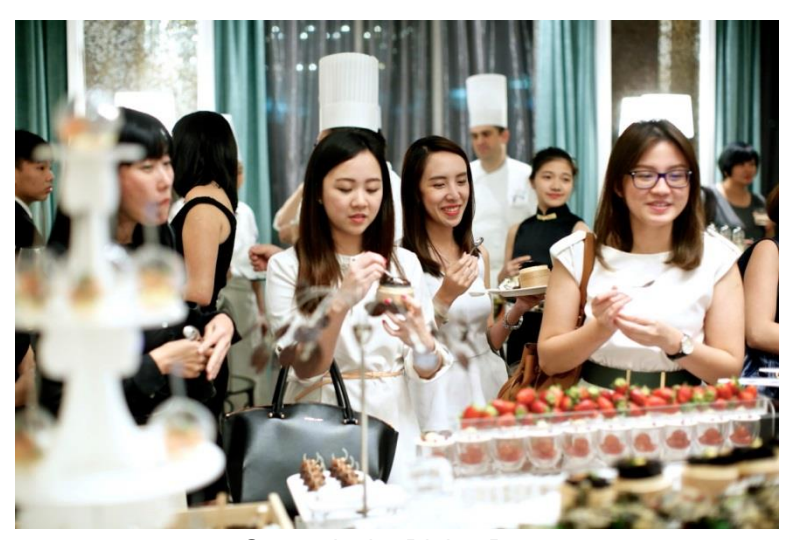
Guests in the Dining Room