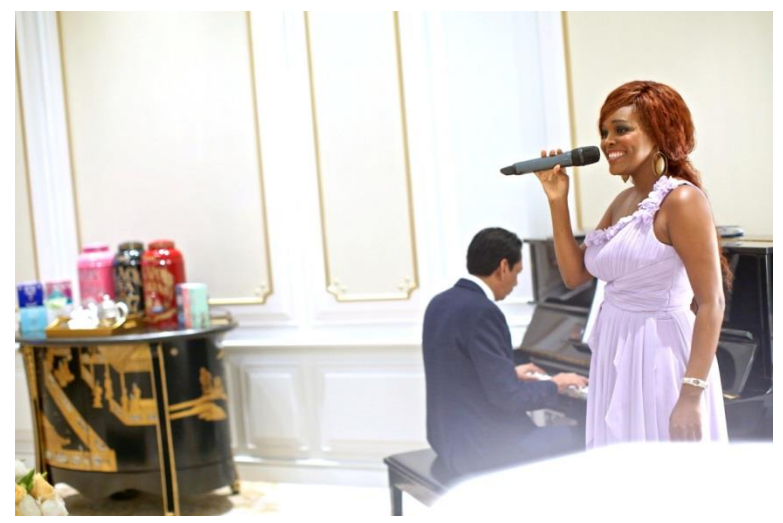
Live Entertainment in the Living Room