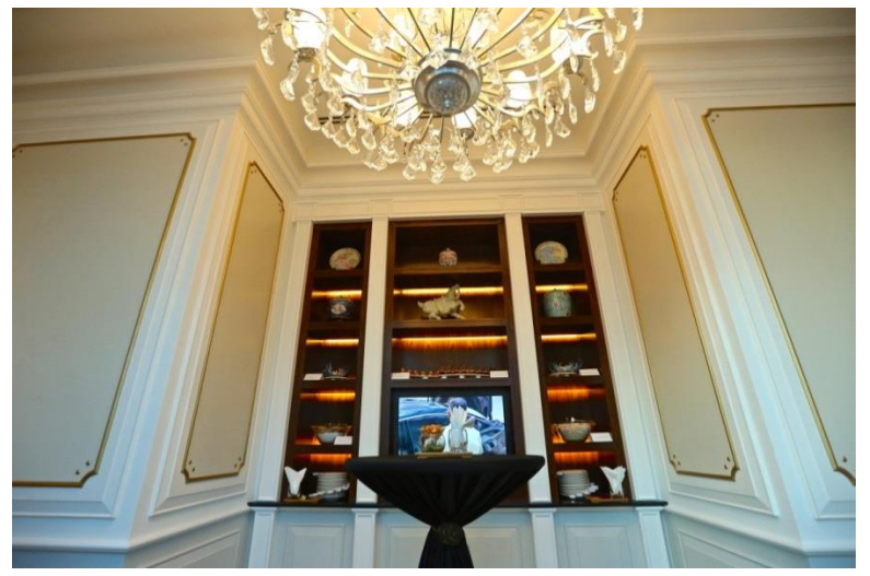
Dessert Presentations on Display Shelves