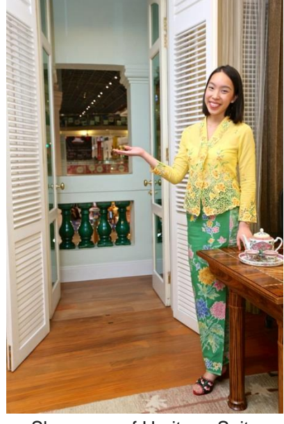
Showcase of Heritage Suite