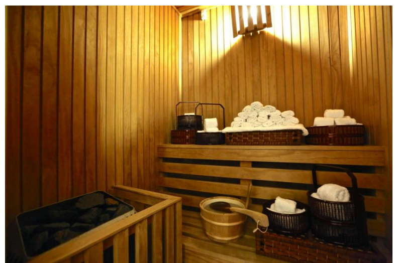
Hot Hand Towels in the Presidential Suite's Sauna