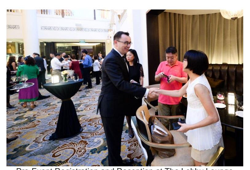
Pre-Event Registration and Reception at The Lobby Lounge