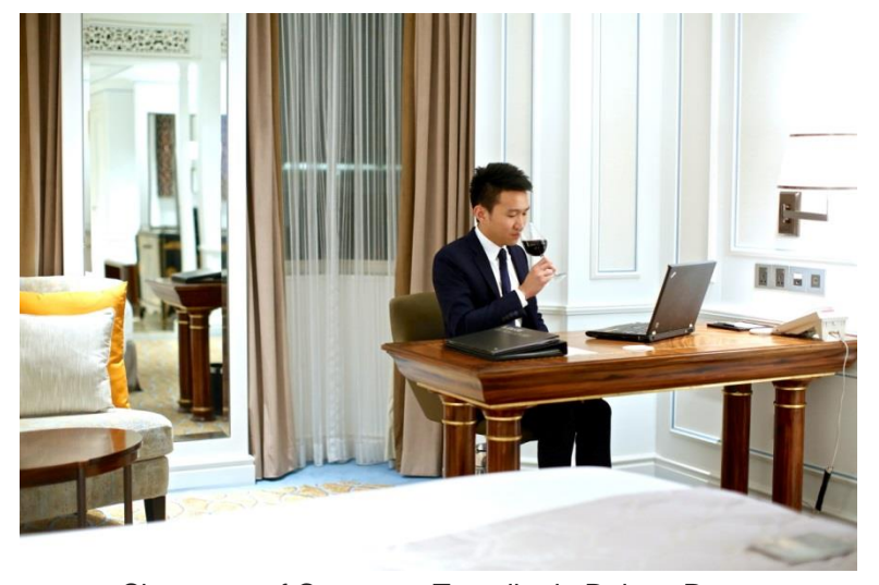
Showcase of Corporate Traveller in Deluxe Room