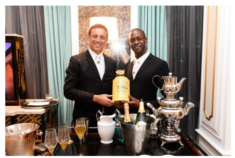
Beverage Setup by Representatives from TWG Tea