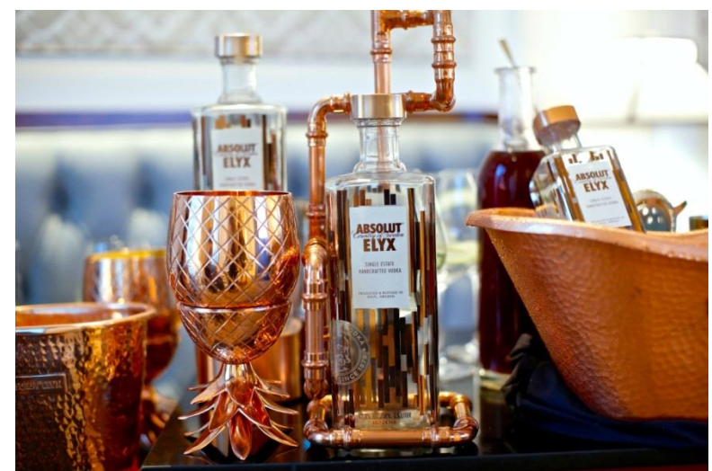
Beverage Setup by Pernod Ricard