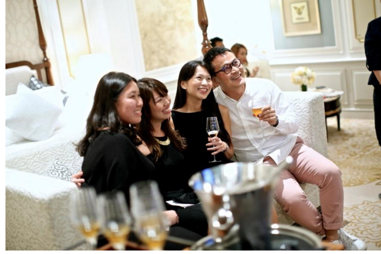
Photography in the Bedroom