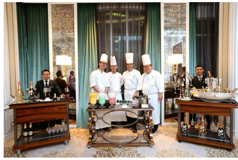
Dessert and Beverage Setups in the Living Room